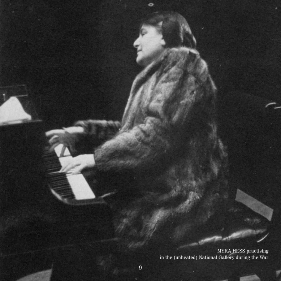
MYRA HESS practising in the (unheated) National Gallery during the War