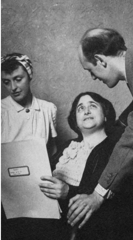
MYRA HESS with HOWARD FERGUSON and JOYCE GRENFELL in the National Gallery

Then at her last recording session, on 12 October 1957, despite a pattern of failing health, she produced nine remarkable miniatures on the same day. Some of these were being committed to disc for the first time, such as her compelling reading of Für Elise , a fitting contrast to her moving treatment of Beethoven's E flat Bagatelle from Op 126. And few of her recordings can surpass the exquisite beauty of her sparkling A major Lied from Mendelssohn's Op 102 (all on Disc 4), where the extraordinary range of her colouring palette has been beautifully captured. She also imparts a subtle beauty to the often hackneyed Brahms Waltz in A flat. But arguably,