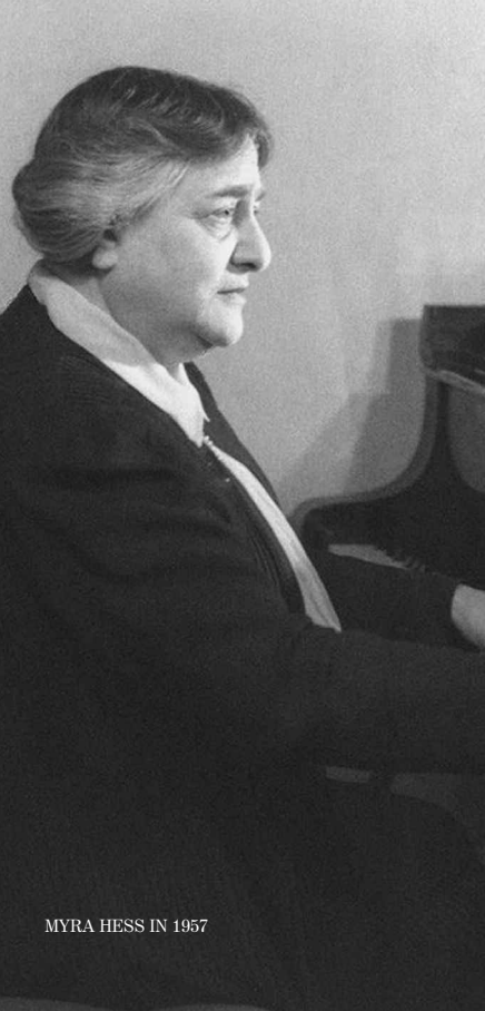
MYRA HESS IN 1957