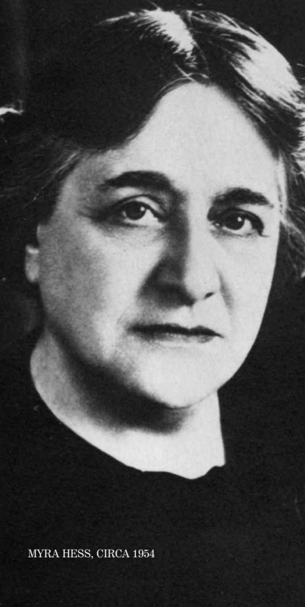
MYRA HESS, CIRCA 1954

two. There are miraculous moments in each of Myra's accounts, but the greatly accelerated coda in her first version is especially interesting. The most noticeable difference in the two C minor Scarlatti renderings is her ornamentation, for by the late 1940s – heeding the advice of her friends Arthur Mendel and Howard Ferguson – she was often beginning her pre-Classical embellishments on the upper accessory. Both of her G major Sonatas are captivating, but interestingly enough, the LP version is a bit faster.